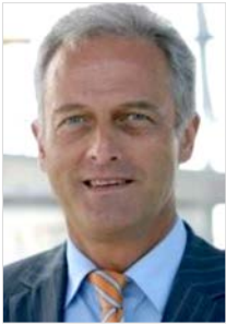
H.E. Dr. Peter Ramsauer