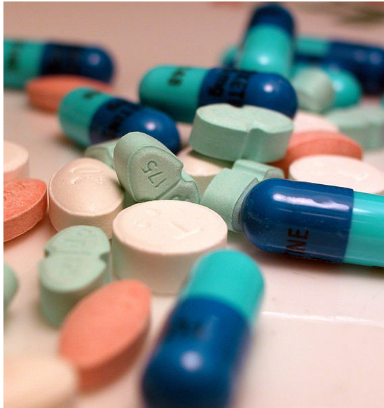
Various pills