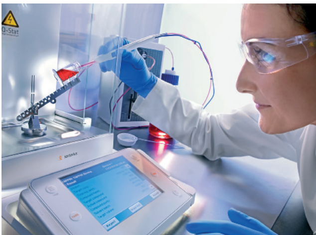
Sartorius is a premium supplier of high-quality laboratory instruments, consumables and services.