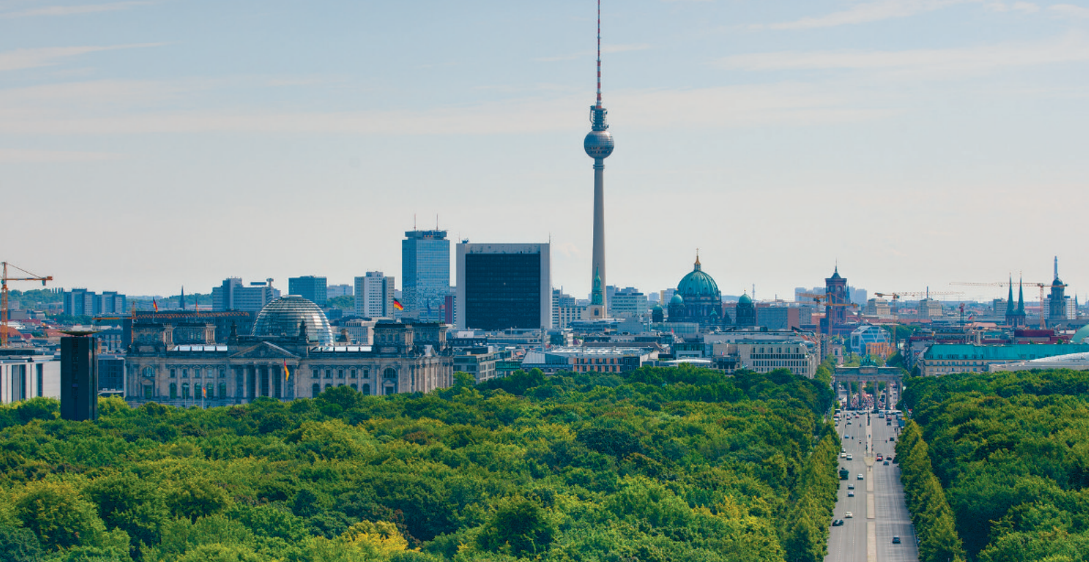
View from the Victory Column towards the German Parliament, Berlin TV Tower and Brandenburg Gate.