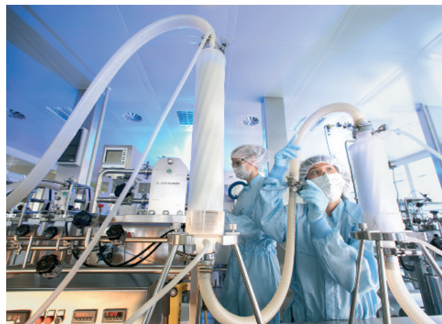
Sartorius helps customers of the biopharmaceutical industry to manufacture medications and vaccines safely and efficiently.