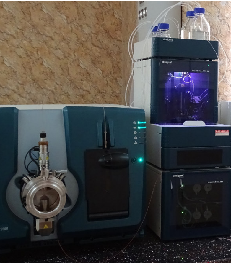
Liquid chromatography coupled tandem mass spectrometry system, manufactured by Sciex.